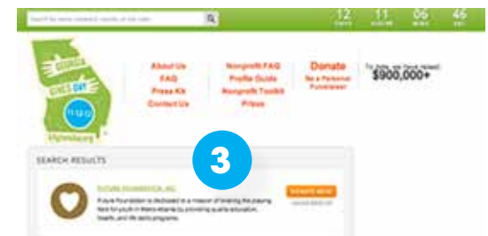
3. CHOOSE "FUTURE FOUNDATION"