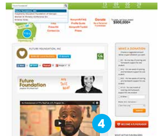
4. CLICK "BECOME A FUNDRAISER"