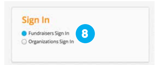
8A. CLICK “FUNDRAISER SIGN IN”